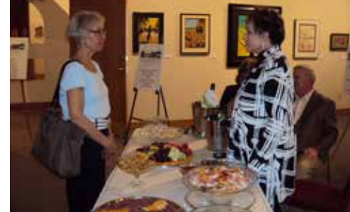
Russell Main Street Membership Appreciation

Through the city of Russell Neighborhood Revitalization Plan, qualifying developments can earn a percentage of property taxes back through investments in properties within a defined area of the community. Contact Russell Main Street for more details.