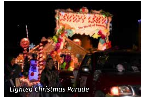
Lighted Christmas Parade