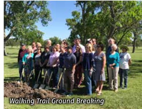
Walking Trail Ground Breaking

Russell is not a "resting" community. We continue to see ways to enhance the business and community environment in existing areas to facilitate growth for our commercial business partners and position Russell as a successful economic competitor.