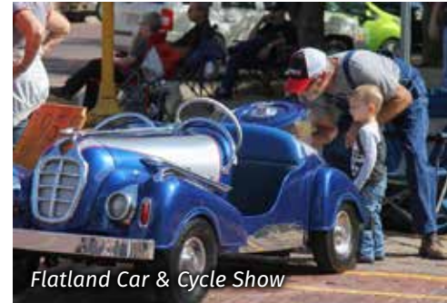
Flatland Car & Cycle Show