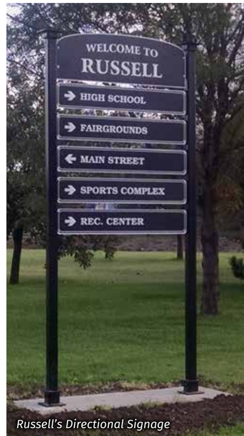
Russell's Directional Signage