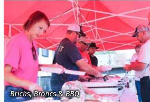
Bricks, Broncs & BBQ

Flatland Car and Cycle Show organized by Russell Rotary takes place the first weekend in October in conjunction with Bricks, Broncs & BBQ. On average 100 classic cars and cycles line the streets of Downtown Russell for this event.